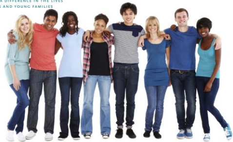
National membership organization focused on adolescent sexual & reproductive health.