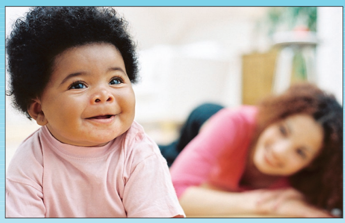
Generously Supported by the Freddie Mac Foundation